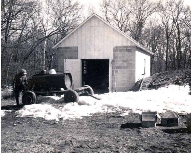
Figure 5. This is a south view of the new sugar house before the addition was constructed in 1996.