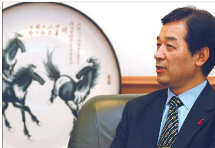
Longde's journey. Health Vice Minister Wang Longde says he's seen a "huge change" in the central government's AIDS policy.

Epidemiologists divide China's AIDS epidemic into three phases. During the entry phase, from 1985 to 1988, the country recorded only 22 HIV infections, and officials viewed the disease as a foreign problem. China's health minister declared in 1987 that the disease could be kept at bay because homosexuality and promiscuity were limited. The government banned the import of blood products and barred HIV-infected foreigners from living in China, and