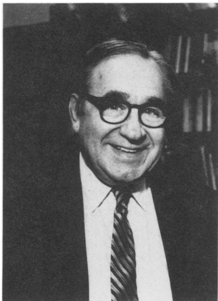
Robert W. Fogel