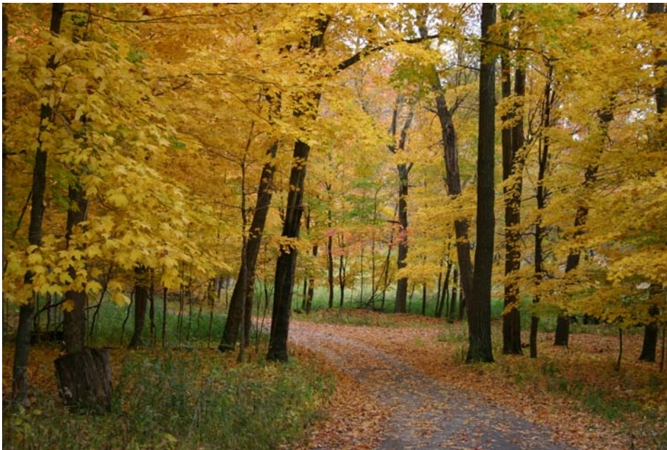
Figure 2. The St. John's sugarbush in the autumn