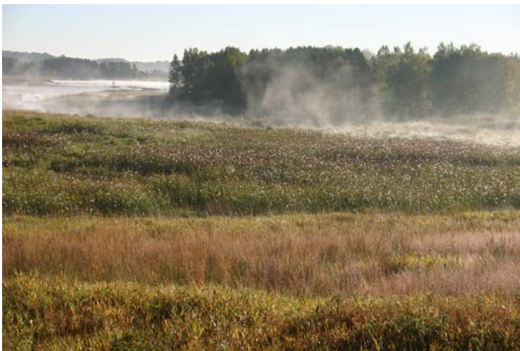
Figure 4. The prairie and wetlands at St. John's