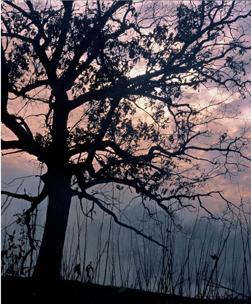
Figure 3. The St. John's savanna