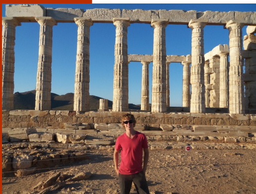
Above: Pickthorn in Greece